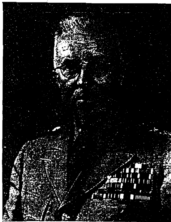
Maj. Gen. Ralph J. Canine, USA

Its officials furnished informal Comsec counsel to the U.S. member of that part of the Standing Group, NATO, which arranged for the security of NATO communications. In meeting NATO's requirements, NSA devised plans which would enable intercommunication by U.S. Services with each other and with U.K. counterparts, as well as with NATO commands and between NATO Governments.